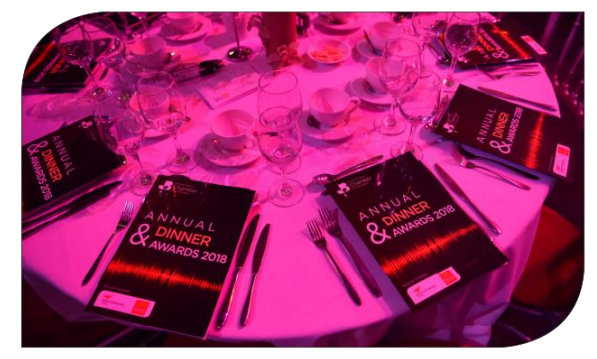
Your logo will be included in our glossy award brochure and placed at every table setting with the opportunity for additional advertising space