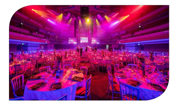
Logos will be visible on three screens during your sponsored segment and reoccurring at points through the night